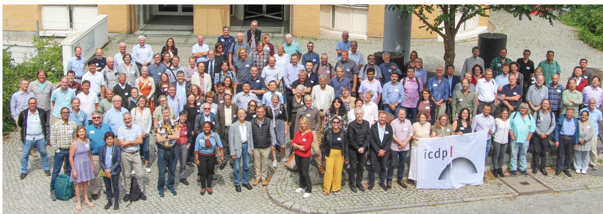
Participants of the ICDP conference at Potsdam.

https://www.gfz-potsdam.de/en/press/news/details/nachlese-icdp-konferenz-am-gfz