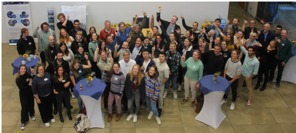
Participants of the Ocean Volcanism workshop at GEOMAR

https://www.geomar.de/en/news/article/allianzen-schmieden-fuer-die-marine-vulkanologie