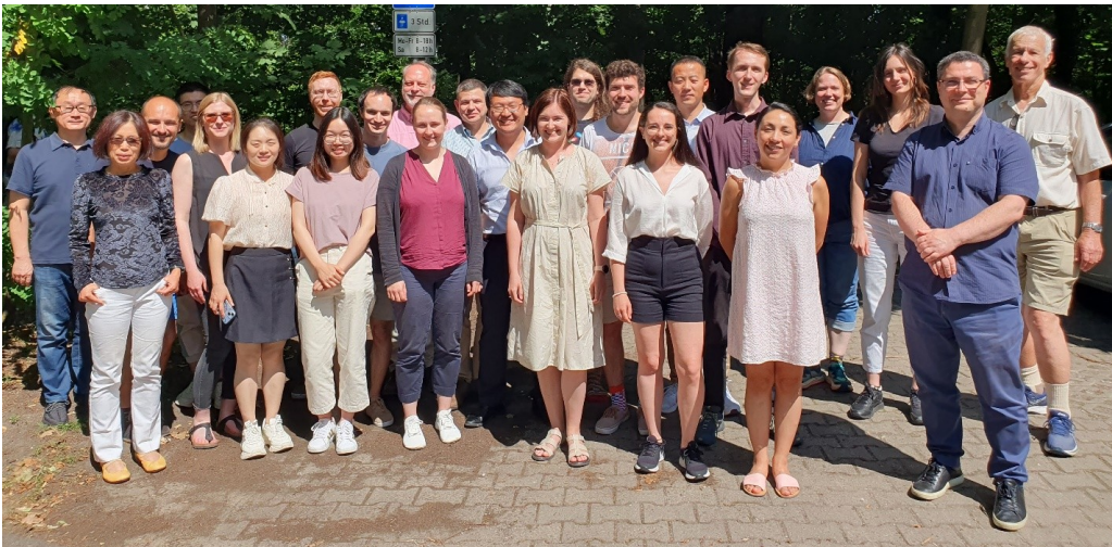
Participants of the Workshop on "Selected Topics in Space Physics".

From July 11-12, 2023 scientist from Germany, the United States, China and the Czech Republic met at GFZ Potsdam to foster the interplay between various subsets within space physics. The presentations covered topics from ionospheric, magnetospheric, solar and solar wind physics. The following discussion accentuated the interconnectivity between these distinct subdomains and the participants identified outstanding questions, methodological approaches and overarching themes.