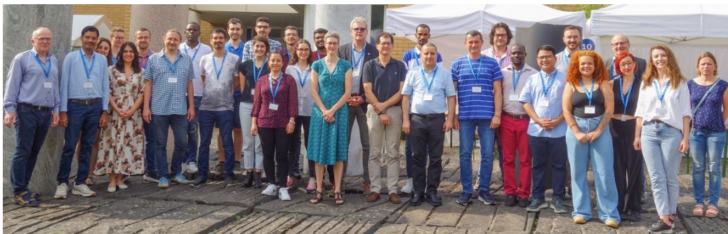
Course participants and lecturers of the 2023 UNESCO training course on "Seismology and Seismic Hazard".

https://www.gfz-potsdam.de/en/about-us/education-and-training/seismology-and-hazard-assessment