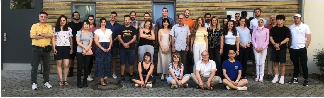
Participants and lecturers of the Training course on cean bottom seismology.