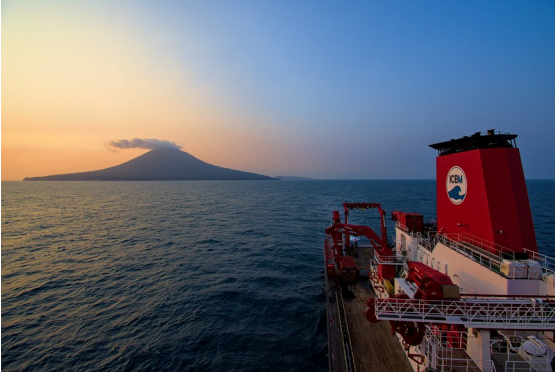
Anak Krakatau as seen from board of the RV Sonne.